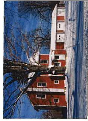
065200 308.00-1-3 3944 Miller Rd