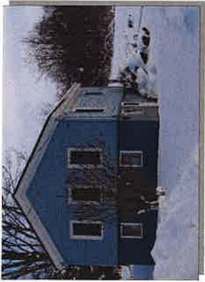
065200 342.00-1-64 3018 North Rd