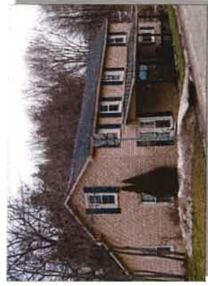
065200 359.06-2-9 10344 Main St