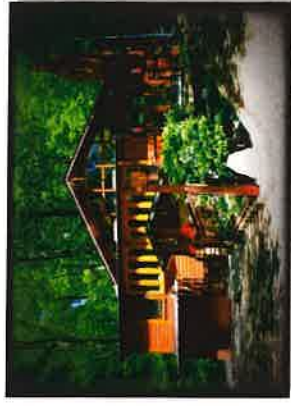
065200 359.14-4-1.2 2545B Parsonage Rd

Prop Class: 210 1 Family Res Neighborhood: 52100 School Code: 063201 Clymer Land Size: 2.60 Bldg Style: 06 Contemporary Condition: 3 Normal Grade: C Average Fireplaces: 0 Bedrooms: 3 Full/Half Baths: 2 / 0 Square Foot: 2069 Land Av: $32,100 AV TOS: $200,000 Sale Date: 11/15/21 Sale Price: $205,000 Sale Price/Sqft: $99.08