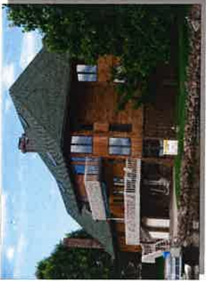
065200 359.06-3-49 2747 Sunnyside Rd