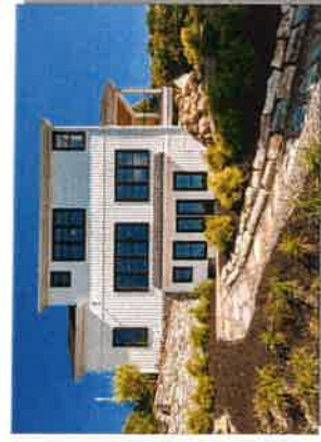
065200 359.11-1-20 2535 Sunnyside Rd