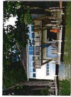
065200 359.19-1-32 2365 Sunnyside Rd