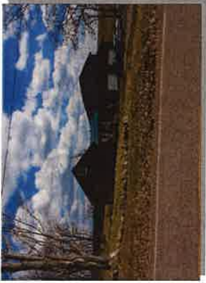
065200 343.14-1-16 2930 Mina French Creek Rd