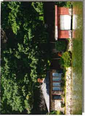
065200 359.11-1-23 2575 Sunnyside Rd