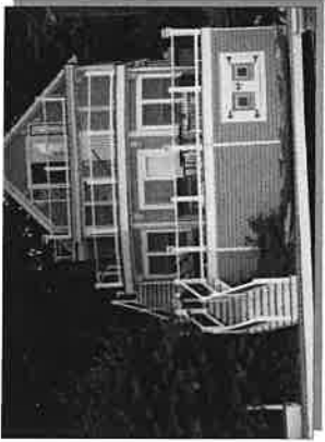
065200 376.07-1-32 2254 Shadyside Rd