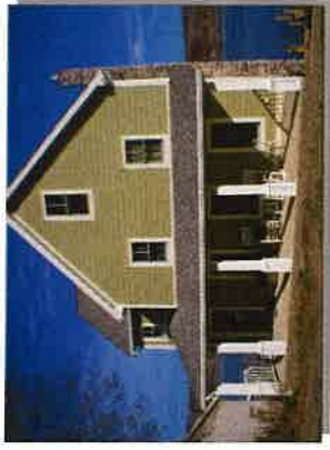
065200 359.14-1-11 2604 Shadyside Rd