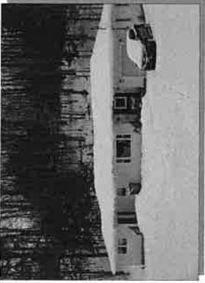
065200 359.14-1-59 2566 Parsonage Rd