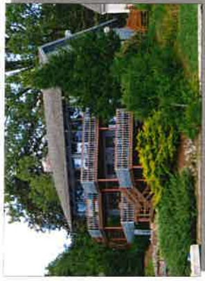
065200 359.19-1-29 2365 Sunnyside Rd