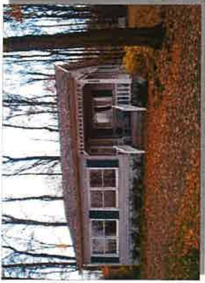
065200 376.07-1-53 2283 Shadyside Rd