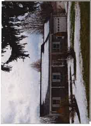
065200 376.00-2-23 2131 Shadyside Rd