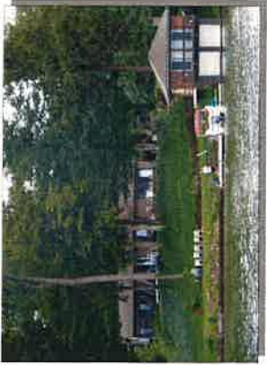
065200 376.07-1-16 2288 Shadyside Rd