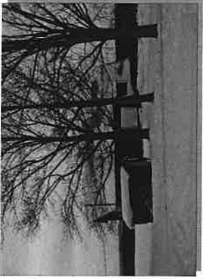
065200 360.00-1-15.1 9459 Bailey Hill Rd