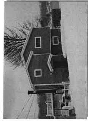
065200 359.11-1-17.2 2531 Sunnyside Rd