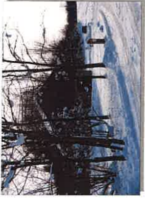
065200 326.00-1-31 9777 Hazen Rd

Prop Class: 240 Rural res Neighborhood: 52200 School Code: 063201 Clymer Land Size: 37.00 Bldg Style: 06 Contemporary Condition: 4 Good Grade: C Average Fireplaces: 1 Bedrooms: 3 Full/Half Baths: 2 / 0 Square Foot: 1598 Land Av: $139,500 AV TOS: $227,000 Sale Date: 09/16/20 Sale Price: $345,000 Sale Price/Sqft: $215.89