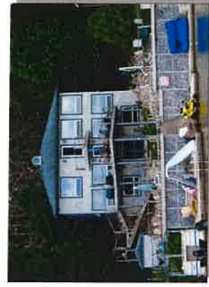
065200 376.07-1-29 2260 Shadyside Rd