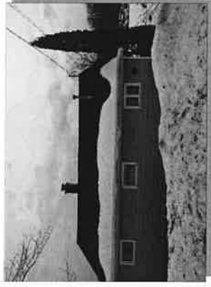
065200 376.07-1-46 2210 Shadyside Rd