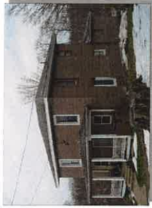
065200 342.18-1-22 10346 School St