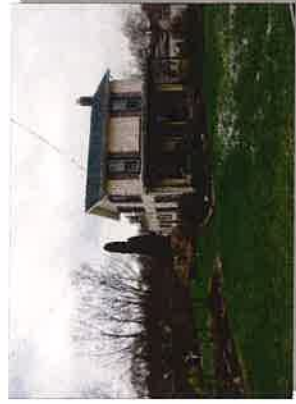
065200 359.06-2-21 2797 North Rd