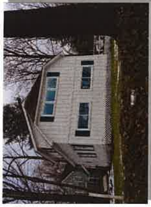
065200 359.15-2-63 2382 Sunnyside Rd