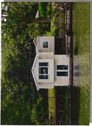
065200 359.10-1-3 2684 Shadyside Rd