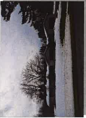
065200 376.00-2-21 2143 Shadyside Rd