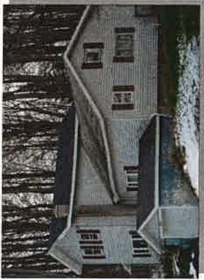
065200 359.06-3-5 10341 Main St