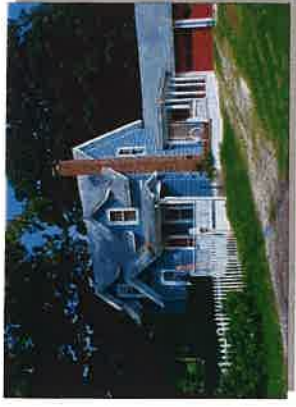
065200 359.06-1-12 10420 Main St