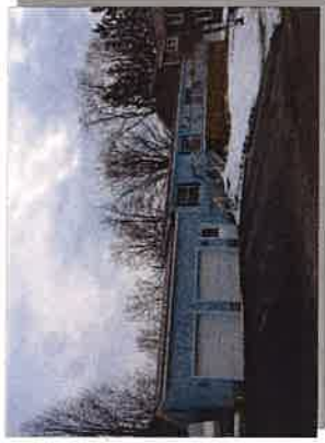
065200 359.06-2-1 2824 Pleasant St