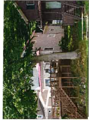
065200 359.14-2-27 2518 Eighth Av