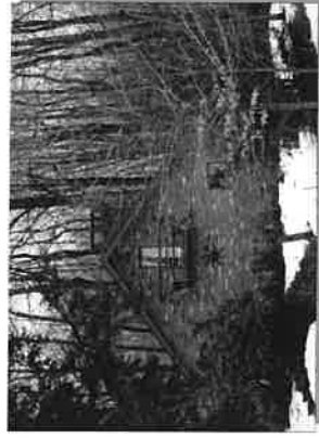
065200 376.00-2-14 2215 Shadyside Rd