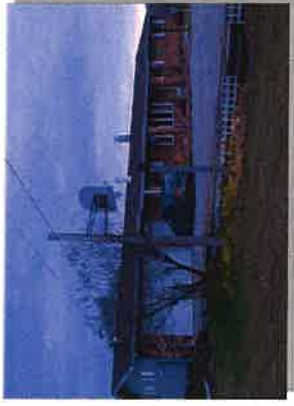
065200 378.00-3-11 9094 Cherry Hill Rd