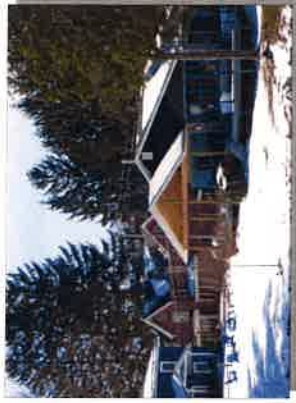
065200 359.06-4-13 2738 Shadyside Rd