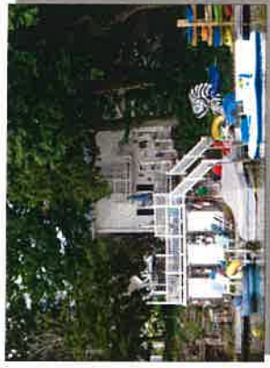
065200 376.07-1-24 2270 Woodland Shores Dr