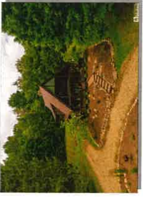
065200 307.00-1-9 10610 Sulphur Springs Rd

Prop Class: 220 2 Family Res Neighborhood: 52200 School Code: 063201 Clymer Land Size: 0.60 Bldg Style: 01 Ranch Condition: 3 Normal Grade: C Average Fireplaces: 0 Bedrooms: 3 Full/Half Baths: 2 / 0 Square Foot: 1902 Land Av: $19,500 AV TOS: $59,000 Sale Date: 12/22/21 Sale Price: $147,500 Sale Price/Sqft: $77.55