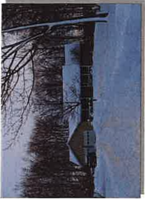
065200 359.10-1-39.3 2644 Ball Diamond Rd