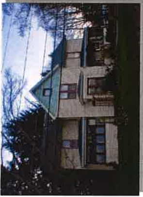
065200 359.06-4-21 2737 Shadyside Rd