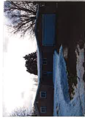
065200 359.11-1-38 2607C Sunnyside Rd