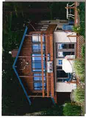
065200 376.07-1-33 2252 Shadyside Rd