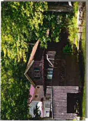
065200 359.14-2-28 2520 Eighth Av