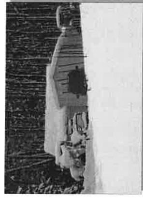
065200 344.00-1-10 9131 Kidder Rd