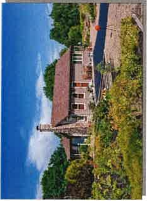
065200 327.00-1-7 3252 Marks Rd