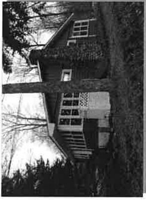
065200 359.15-2-18 10162 Lakeview Ave