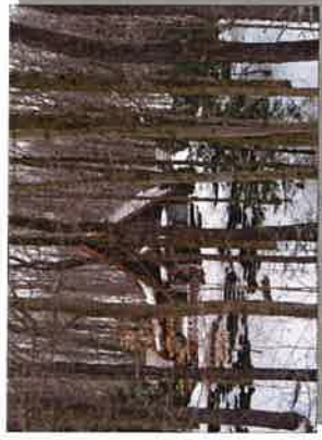
065200 359.14-4-1.1 2245A Parsonage Rd

Prop Class: 210 1 Family Res Neighborhood: 52100 School Code: 063201 Clymer Land Size: 0.33 Bldg Style: 01 Ranch Condition: 3 Normal Grade: D Economy Fireplaces: 0 Bedrooms: 2 Full/Half Baths: 1 / 1 Square Foot: 1044 Land Av: $16,800 AV TOS: $142,000 Sale Date: 03/03/21 Sale Price: $139,000 Sale Price/Sqft: $133.14