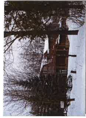
065200 358.00-1-18 2425 W Mina Rd