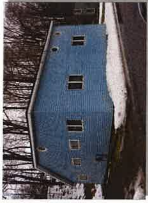
065200 359.10-2-31 2621 Shadyside Rd