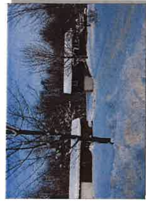
065200 343.00-1-16 9280 Cemetery Rd